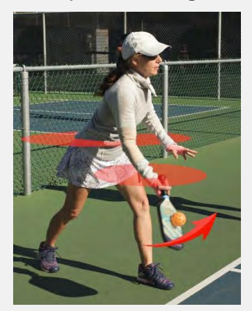
Figure 4-3 (legal serve)