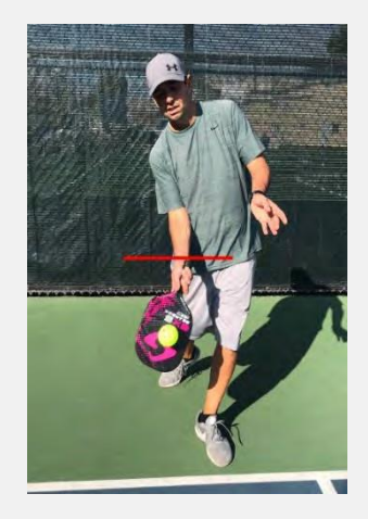
Figure 4-1 (legal serve)