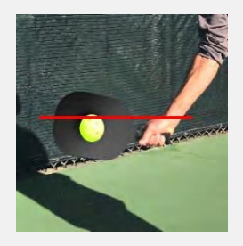
Figure 4-2 (illegal serve)